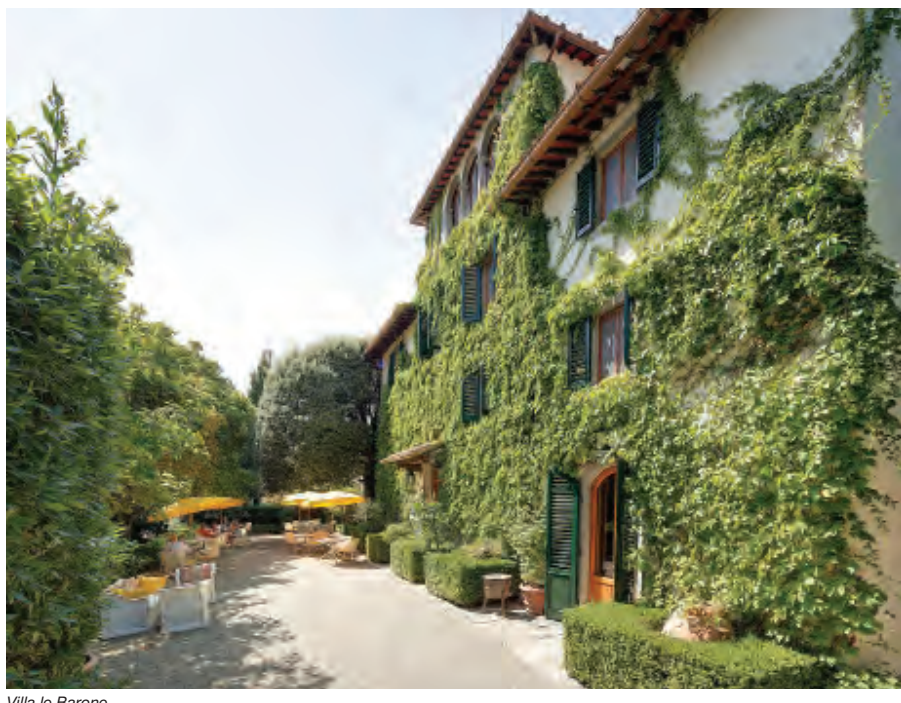
Villa le Barone

Collect your hire car from central Florence. The drive southwards to the heart of the Chianti wine producing area and the Hotel Villa le Barone is about 25 miles and takes around