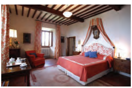
"Historic" room at Villa le Barone

The Eden Hotel Wolff has been one of the leading names in Munich since its foundation in 1890. The Art Noveau building is ideally located opposite Munich Central rail station, making it the perfect stopover point from which to explore the city. The hotel has 210 rooms and suites on offer to guests in a variety of designs from classical through to elegant modern or Alpine stylings, whilst the hotel's restaurant the Peter & Wolff prides itself on the use of seasonal products from the regions suppliers in its menus.