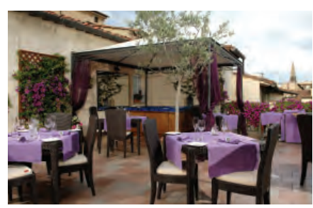
Terrace at Hotel Bernini Palace

This beautiful property is a small privately owned country house set amongst its own grounds of formal gardens, wodded hills, vines and olive groves. Now run as a hotel, there are just 25 rooms offering guests an ambience of warmth, charm and outstanding quality of service. The rooms are located across the main villa and in the four surrounding villas. With beamed ceilings and terracotta floors, antique and original decorations, all of them are utterly in keeping with the regional flavour. The hotel has two breakfast rooms and a restaurant, but all meals are served in the garden in fine weather. The Villa di Monte Solare offers an enticing combination of rustic charm, a beautiful location and charming welcome.